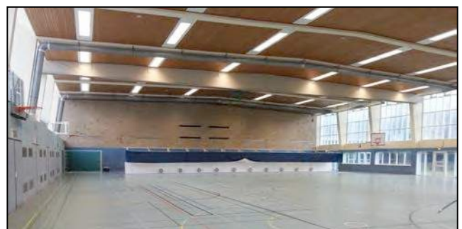
The venue: LSB-Hessen, Frankfurt

2017. The exact address is: Otto-Fleck-Schneise 4, 60528 Frankfurt, Germany.