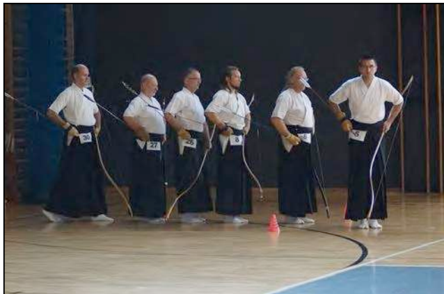
National Taikai 2016

The first attempts to create formal Kyudo groups in Poland were done in 2008. It resulted in raising of three Kyudo clubs: in Wroclaw (Wrocław Kyudo Association), in Pabianice (Kai Kyudo Club) and in Warsaw (Tametomo Kyudo Club). All three groups exist until now and number of their members is continually growing.