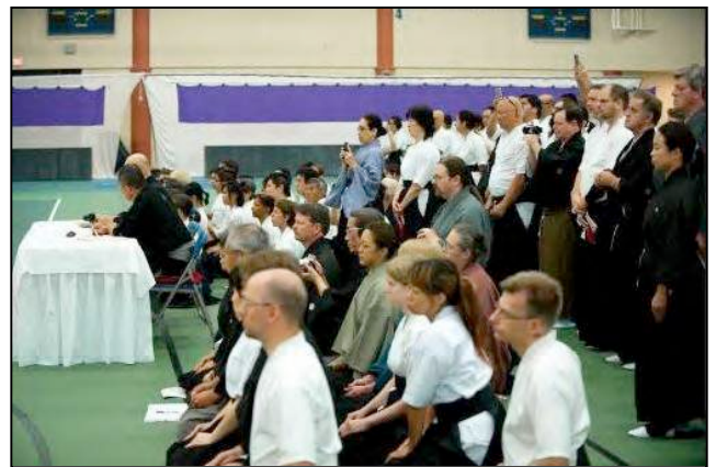
American Kyudo Seminar 2016