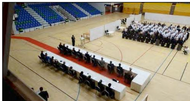
Enbukai – Opening Ceremony

Organizing an Enbukai is something else. It is a by the ANKF tight regulated event. Lucky for us it was to be a demonstration Enbukai, so the regulations were not as strict as e.g. in Paris. Therefore fewer officials were needed. This put less pressure on especially the participation of kyudojin in the execution of the Enbukai.