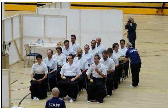
Waiting for Shinsa

It must be said that organizing a seminar and Shinsa is a big but not an impossible job. The most important aspect is the venue where you build the dojo. And of course, you need a lot of volunteers who also want to participate in the seminars. In our case more than 30 Dutch members volunteered. Also we were very lucky to find that European Shogo and other European Kyudojin were willing to offer their support on Shinsa and Enbukai and to function in different roles; another example of cooperation on EKF level.