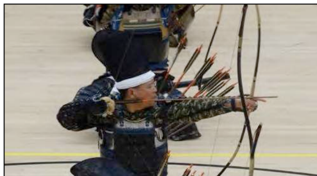
Demonstration: Satsuma Heki-Ryu Koshiya Hozonkai

What was a complex and time consuming job, especially in the preparation of this all, was the celebration of the 10 th anniversary. With the coming of the Her Imperial Highness princess Hisako Takamado everything had to be prepared to the minute, knowing we had to be flexible at the same time. We were of course very honoured that her Imperial Highness came to the anniversary and to Amsterdam. Her coming to the Enbukai made all the efforts very much worthwhile.