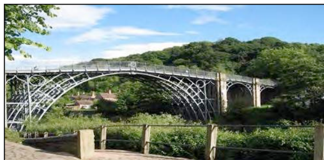
Ironbridge Gorge near Telford

The facility will provide a hall that is large enough for four shajo. There are three large hotels onsite to guarantee suitable accommodation. UKKA has made provisional bookings of the Telford Exhibition Centre from 10th until 25th of July. The IKYF/ANKF will discuss and decide on the programme and the sequence of the seminars when they meet with the local organisers in Tokyo in October. More details and information will be provided to the EKF members in November.